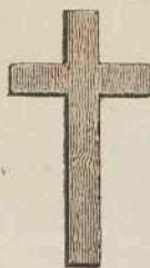
Kreuz — crux croix — cross