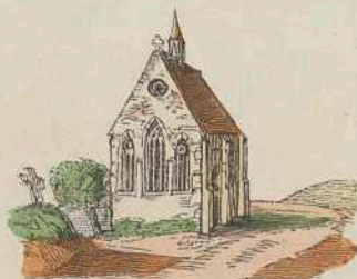
Kirche — templum eglise — church