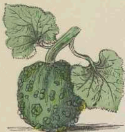
Kürbis — cucurbita courage — gourd