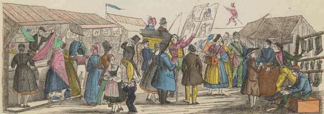
Fohrmartt — mercatus foire — fair