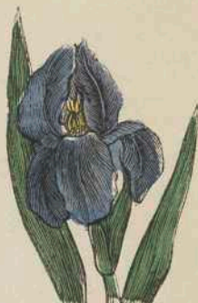
Iris — iris iris — iris