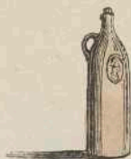
Krug — ureus cruche — jug