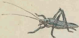
Henschröck — locusta sauterelle — locust