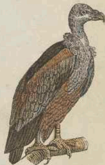
Geyer — vultur vautour — vulture