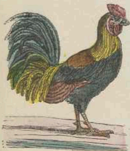
Hahn — gallus coq — cock