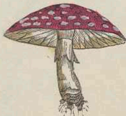
Pilz — agaricus agaric — agaric