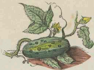
Gurke — cucumis concombre — cucumber