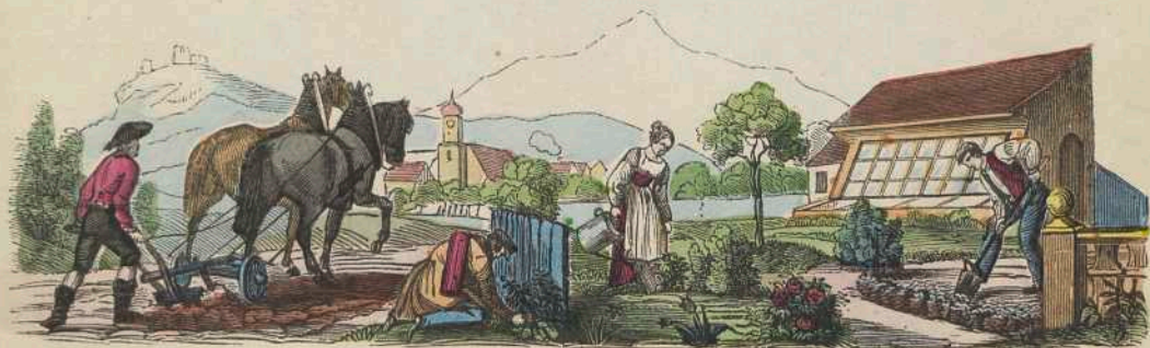
Frühling — ver printemps — spring